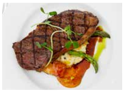
NEW YORK STRIP